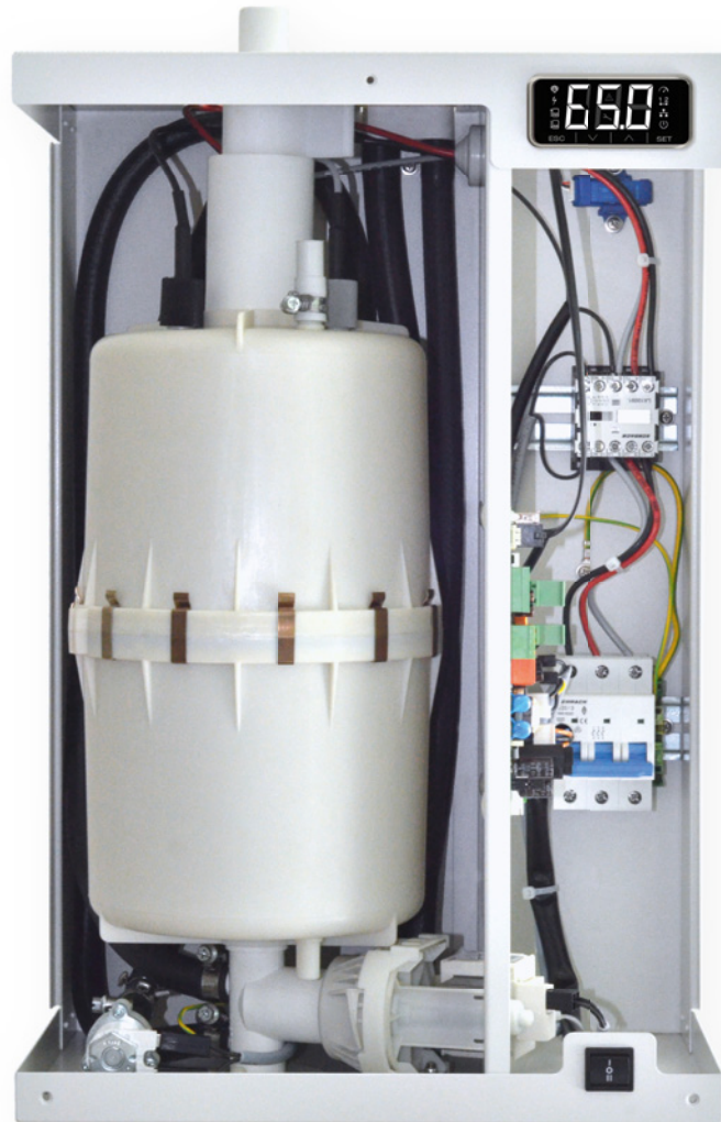
Picture shows StandardLine Electrodes